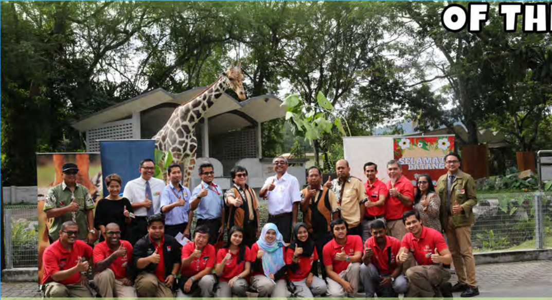
Special thanks to UMW Corporation Sdn Bhd for the sponsorship of three giraffes