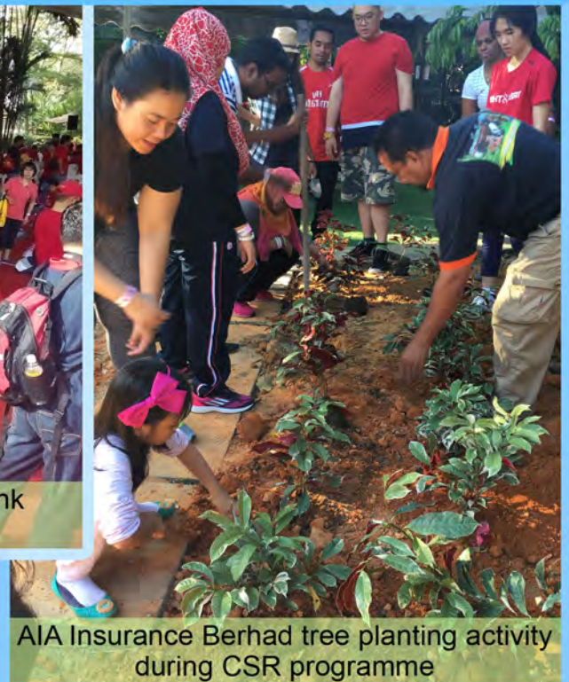
AIA Insurance Berhad tree planting activity during CSR programme