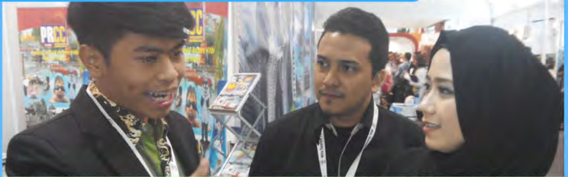
Outreach programme for promoting zoo packages & conveying conservation message at MITA Fair, KLCC