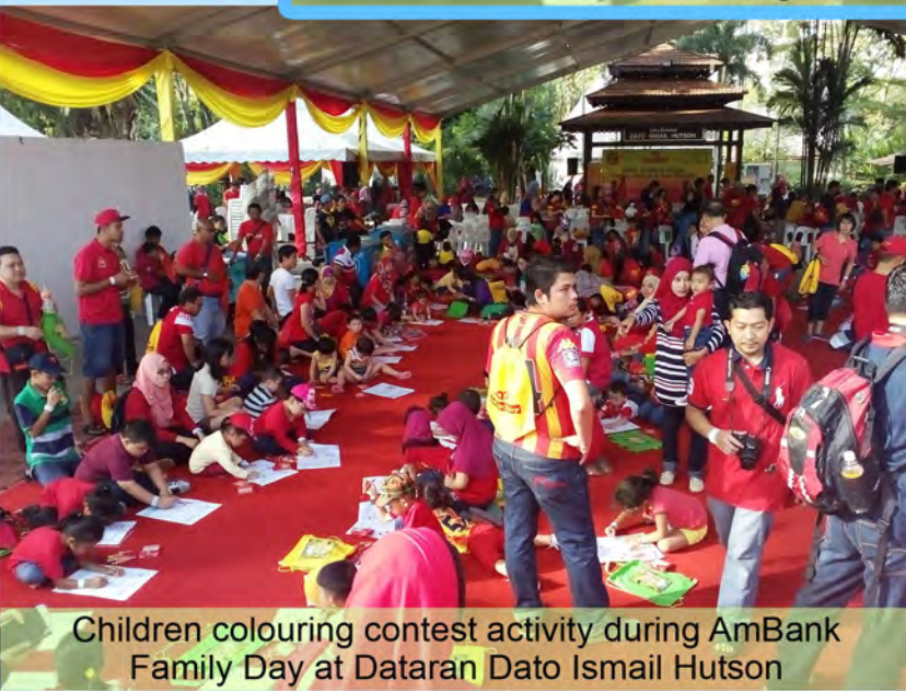
Children colouring contest activity during AmBank Family Day at Dataran Dato Ismail Hutson